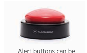
Alert buttons can be placed in high-traffic areas of the home