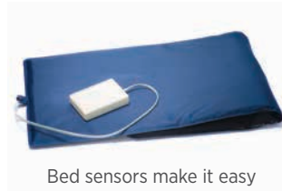
Bed sensors make it easy to see if Mom got out of bed this morning

Get additional peace of mind with 24/7 emergency response for intrusion, fire and medical emergencies.