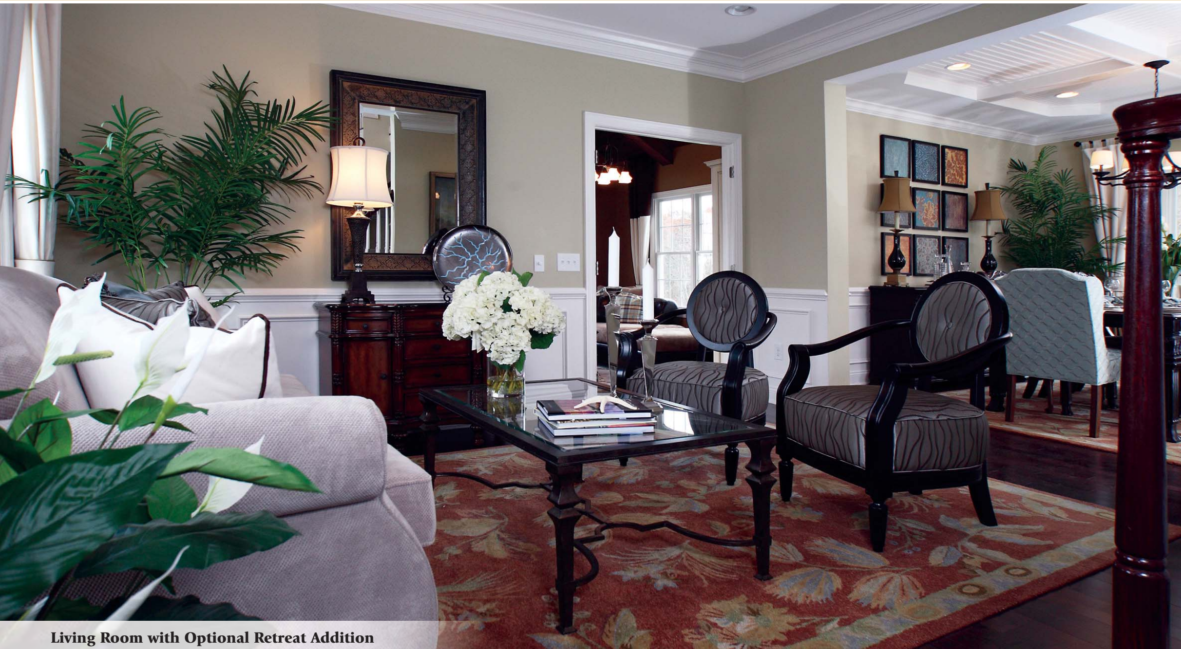
Living Room with Optional Retreat Addition