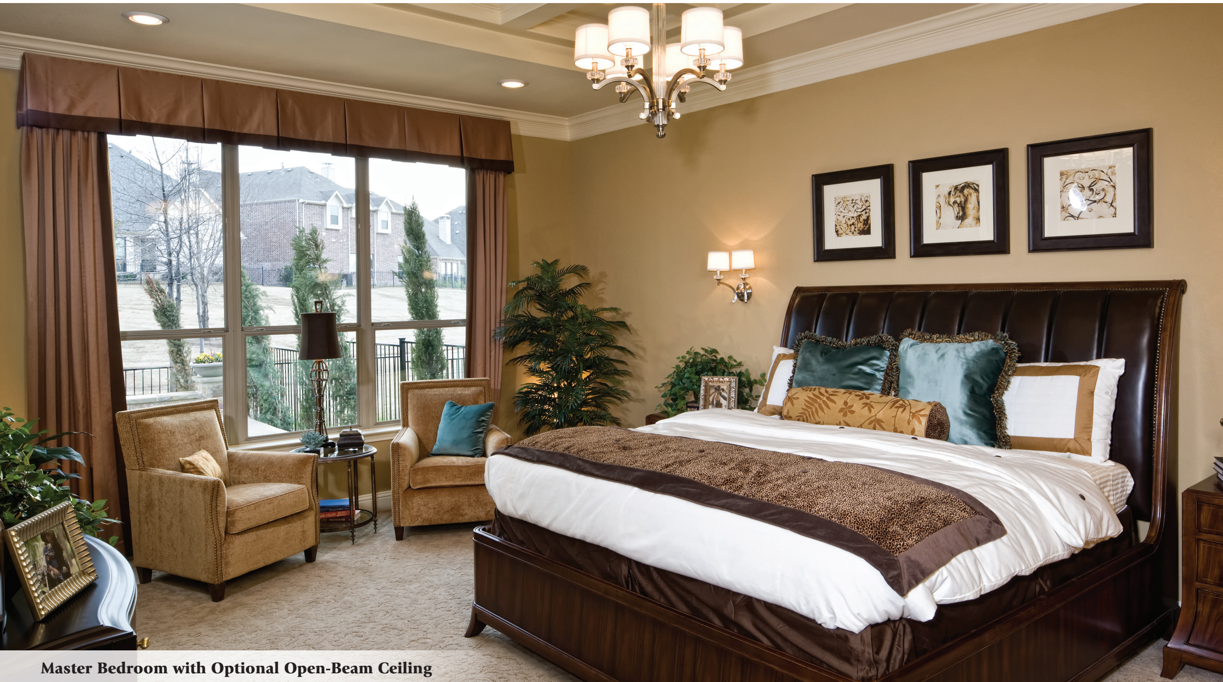
Master Bedroom with Optional Open-Beam Ceiling

Toll Brothers AMERICA'S LUXURY HOME BUILDER®