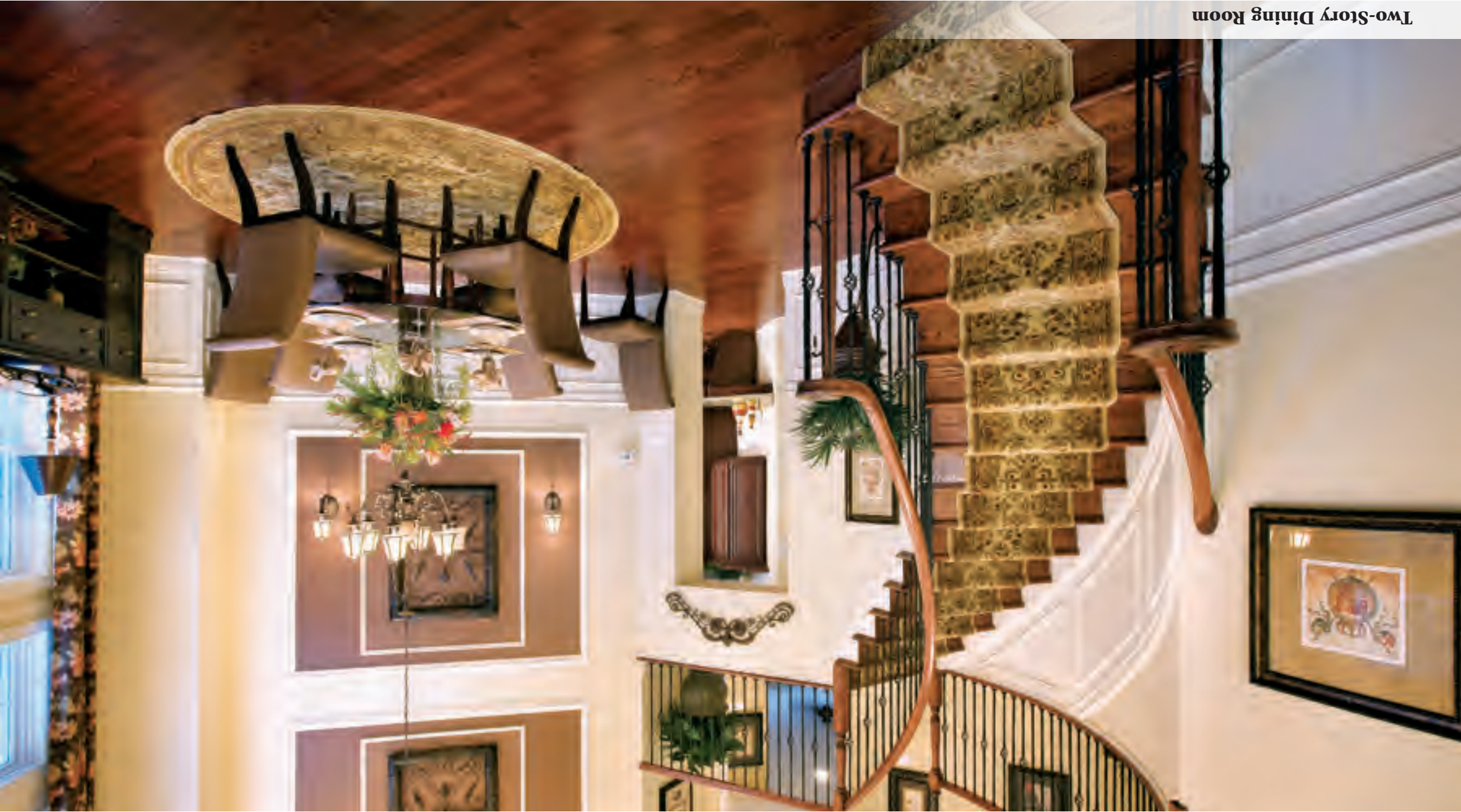
Two-Story Dining Room