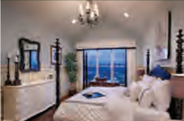
Optional Grand Master Suite