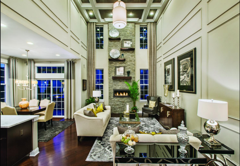
Great Room with Optional Additional Fireplace (features may vary)