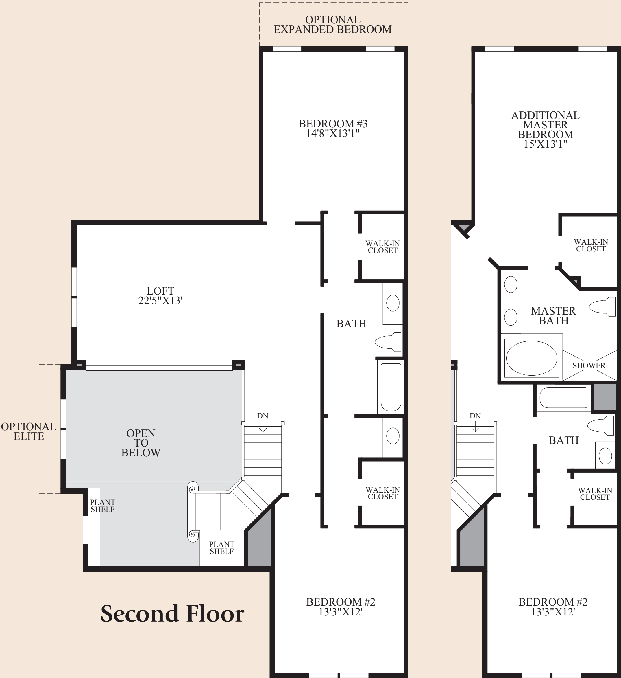
SHOWN WITH OPTIONAL ADDITIONAL MASTER SUITE