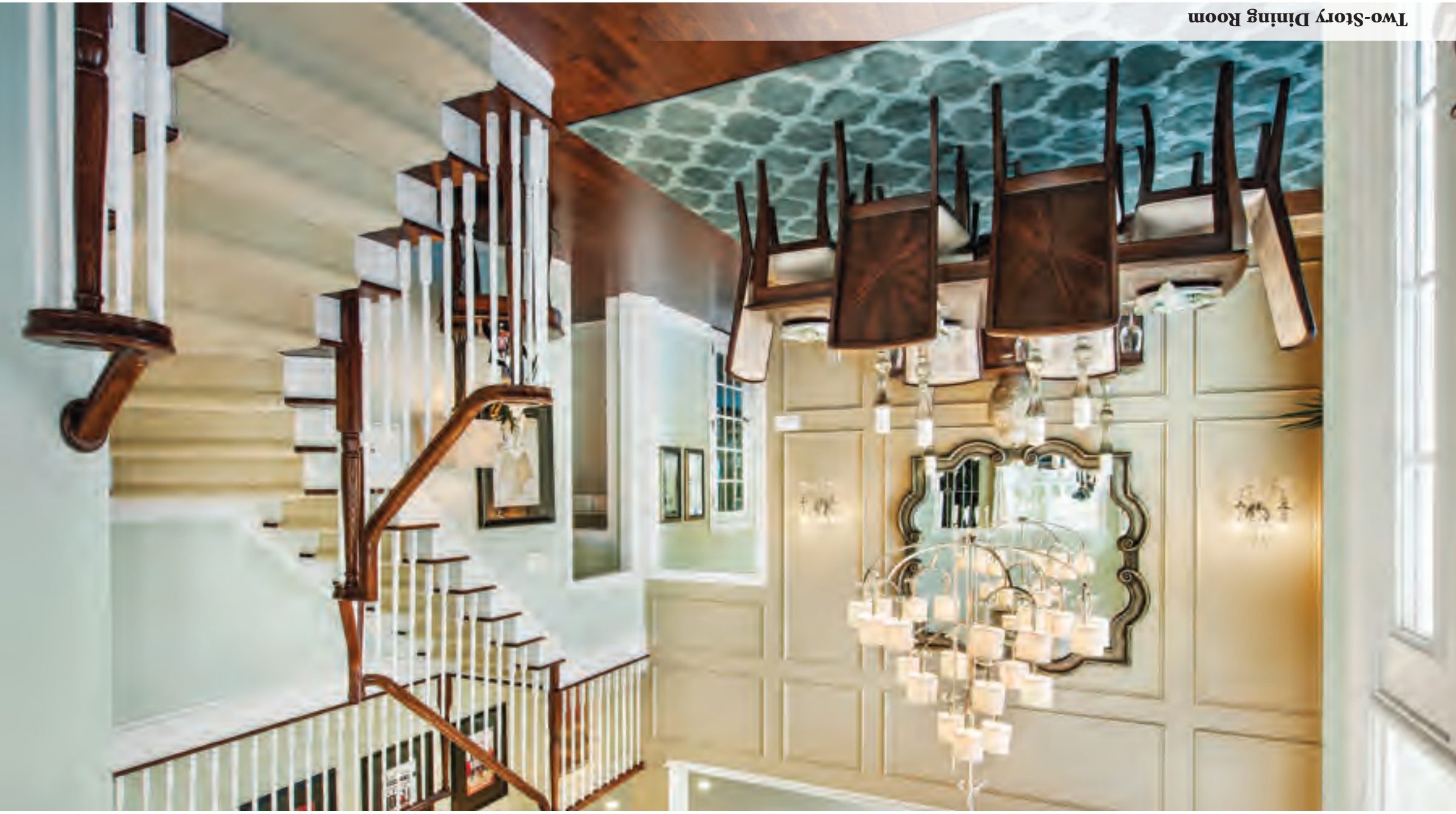
Two-Story Dining Room