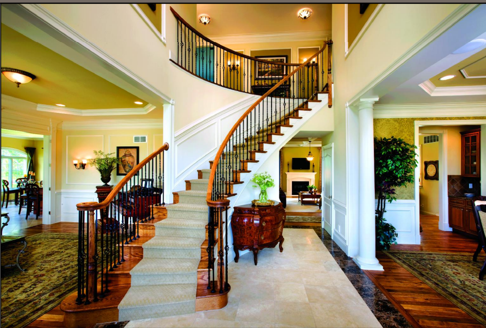
Foyer (Shown With Optional Oak Curved Main Stairs ILO Standard)