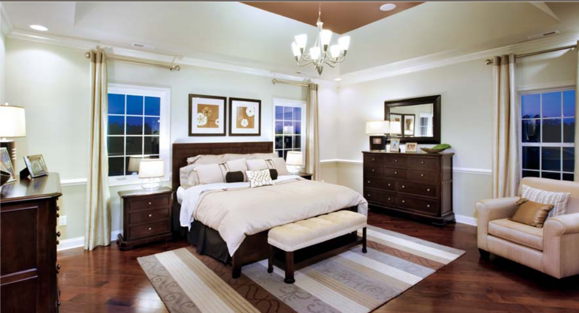
Master Bedroom with Optional Luxurious Master Bath