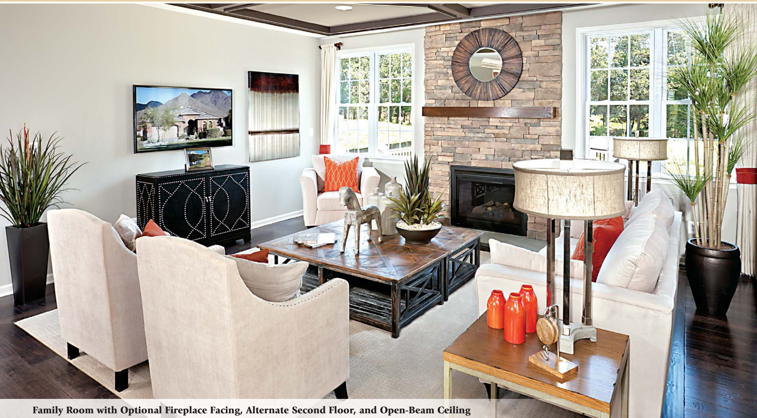
Family Room with Optional Fireplace Facing, Alternate Second Floor, and Open-Beam Ceiling

Toll Brothers America's Luxury Home Builder®