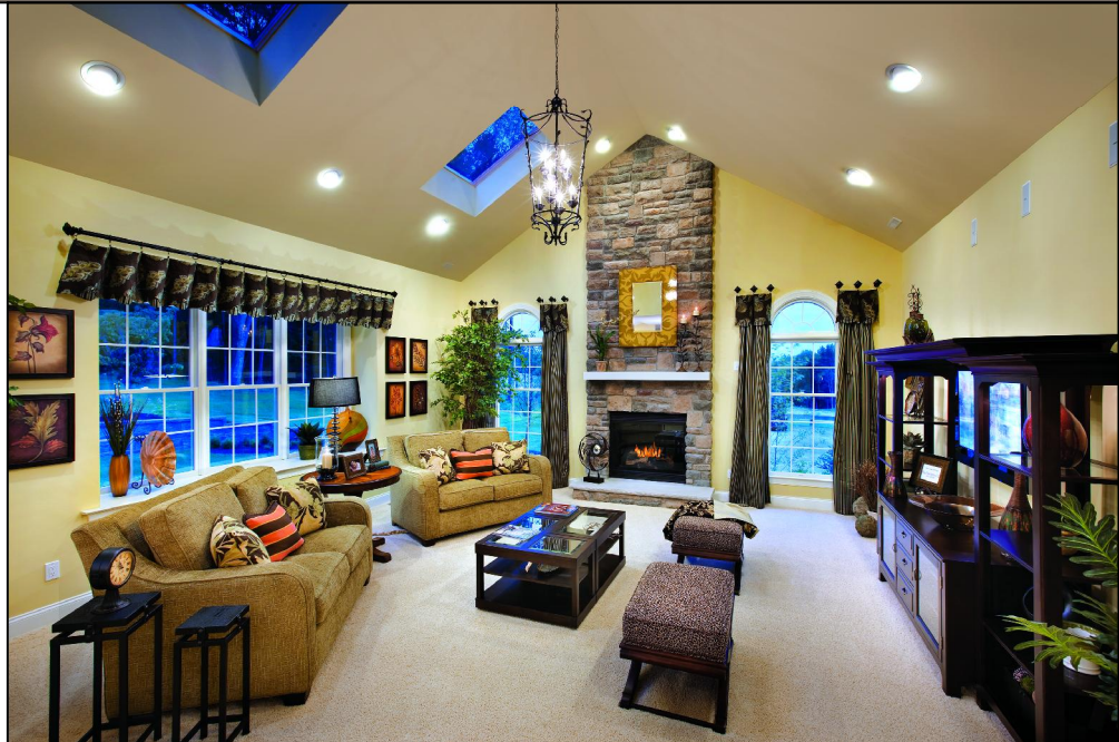
Family Room with Optional Fireplace, Optional Window Package and Optional Skylights