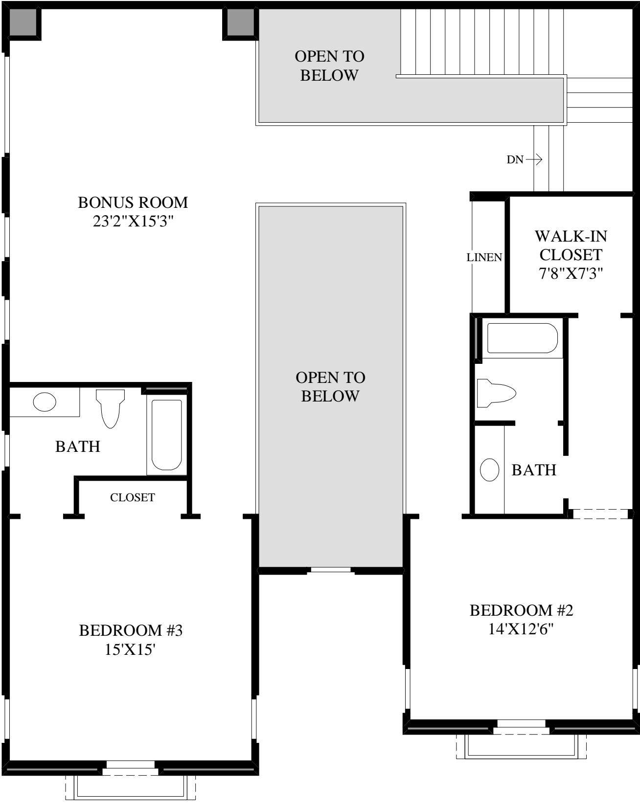
ITALIANATE EXTERIOR DESIGN INCLUDES LARGER DECORATIVE BALCONY.