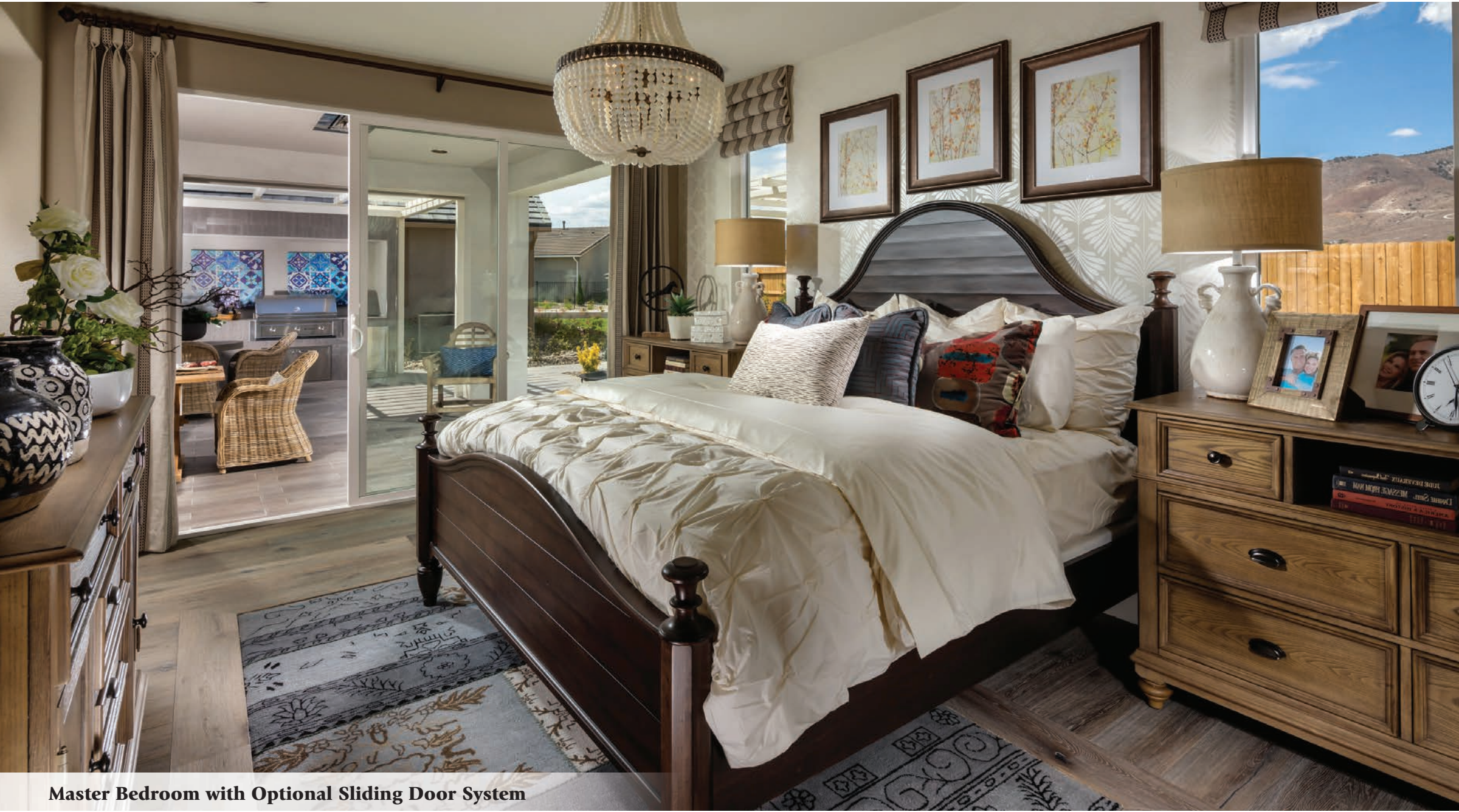
Master Bedroom with Optional Sliding Door System