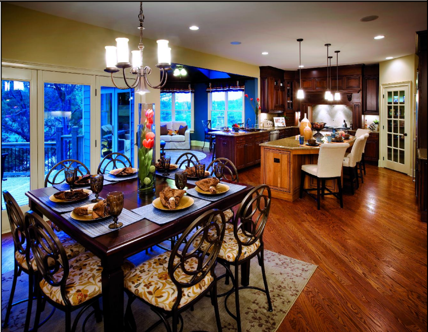
Kitchen with Optional Naples Sunroom (features may vary)