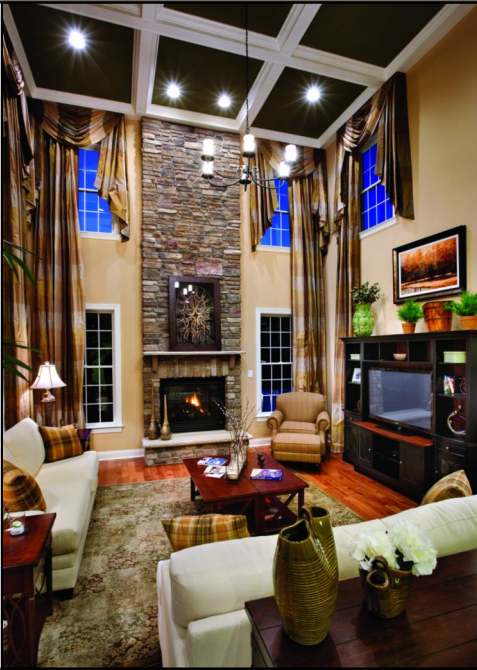
Expanded FamilyRoom with Optional Open Beam Ceiling and Stone Fireplace