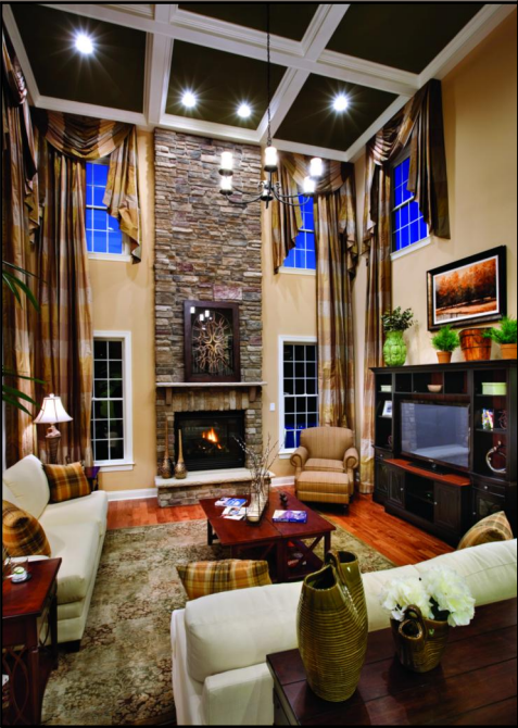
Expanded FamilyRoom with Optional Open Beam Ceiling and Stone Fireplace