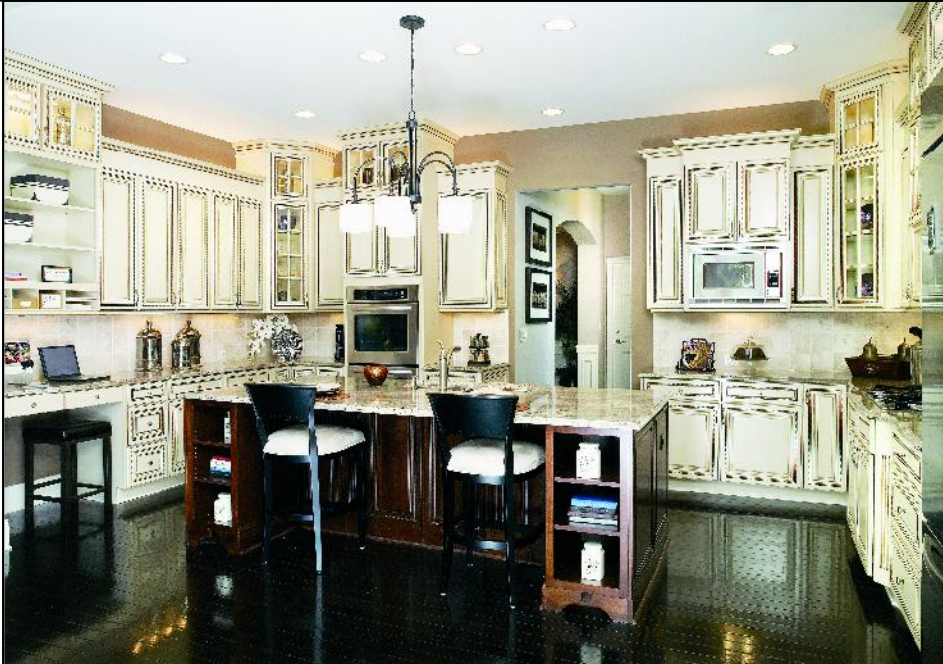
Kitchen Shown with Alternate Kitchen Layout