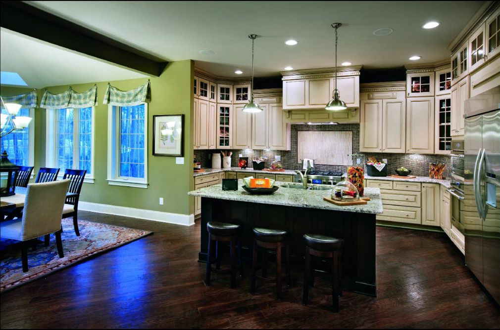
KITCHEN (features may vary)