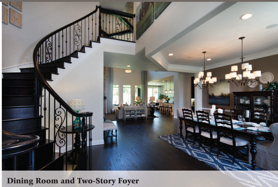
Dining Room and Two-Story Foyer