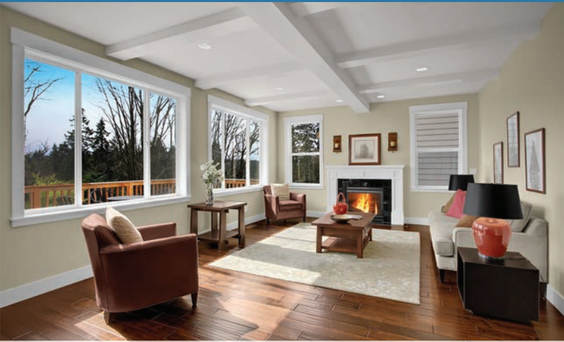
Family Room with Optional Open-Beam Ceiling