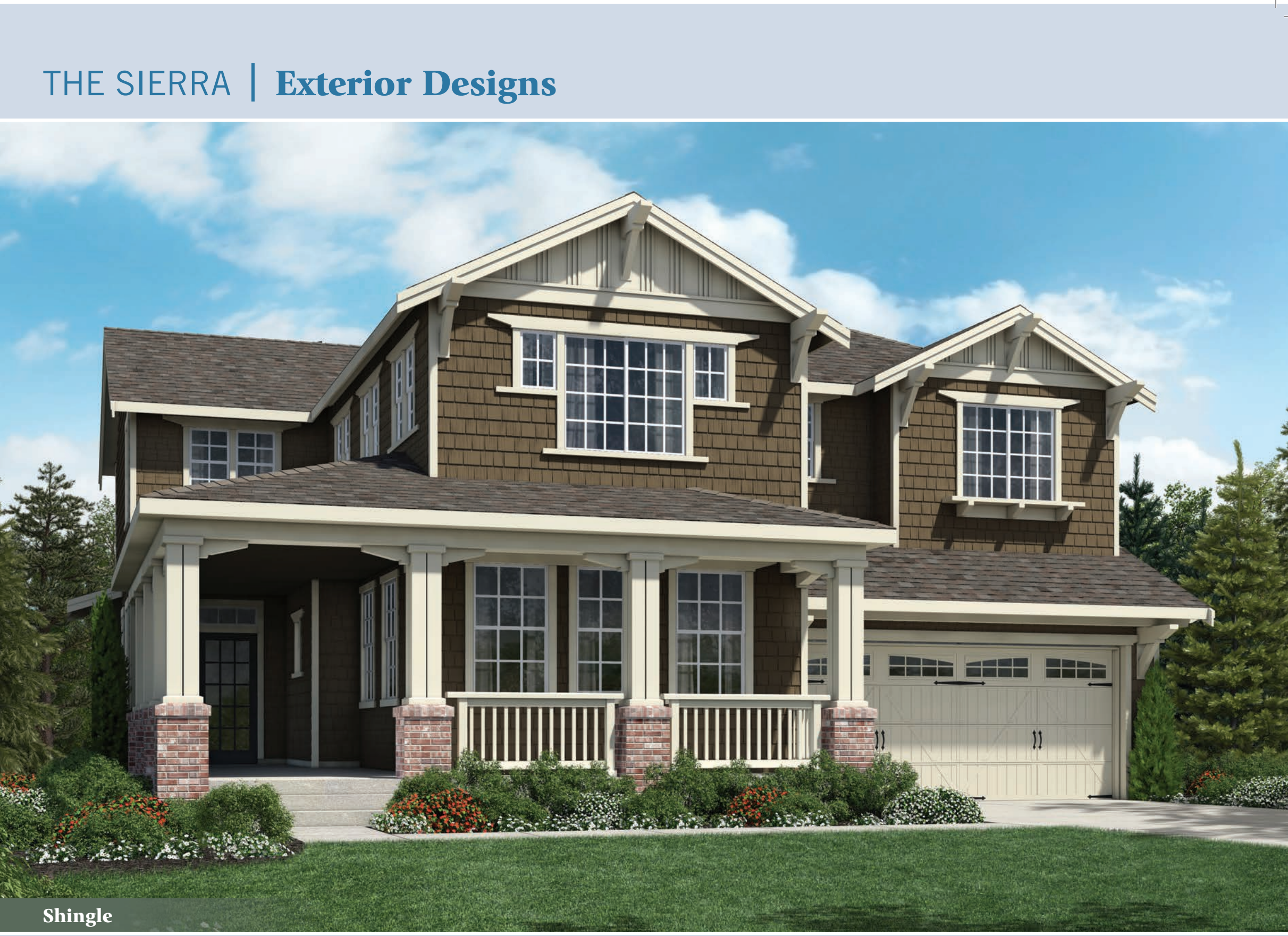
Shingle May be shown with optional features, including but not limited to designer front door and designer garage door.