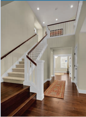
Foyer w/ Optional Railing