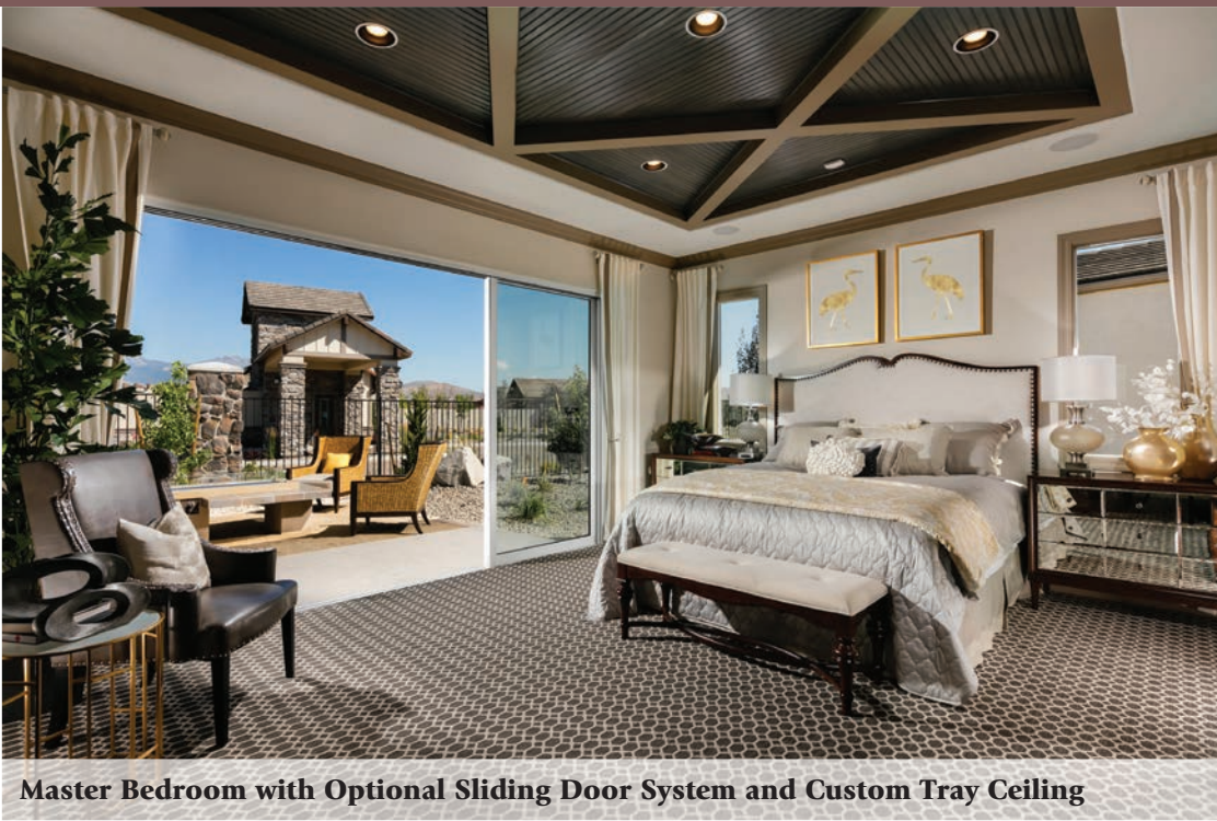
Master Bedroom with Optional Sliding Door System and Custom Tray Ceiling