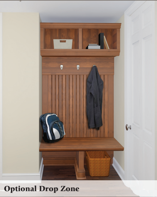
Optional Drop Zone