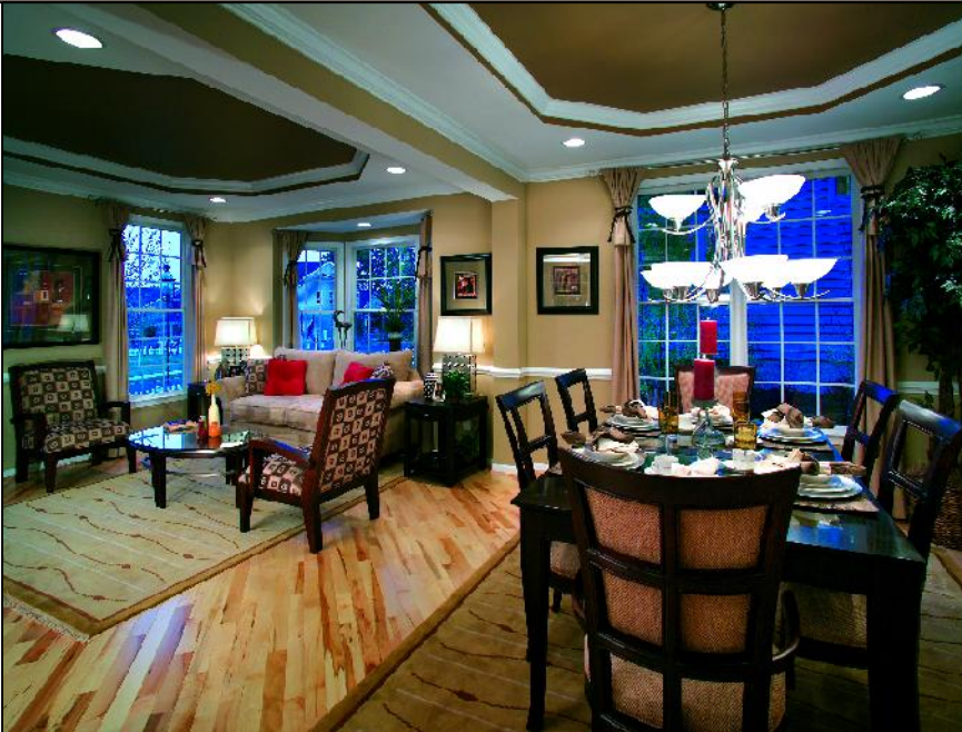
Living Room and Dining Room With Optional Tray Ceilings and Walk-Out Bay Window.