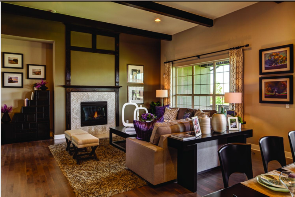
GREAT ROOM WITH OPTIONAL OPEN-BEAM CEILING