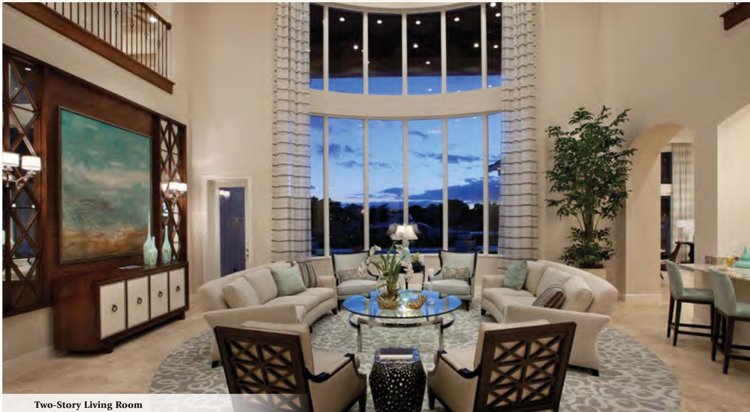
Two-Story Living Room