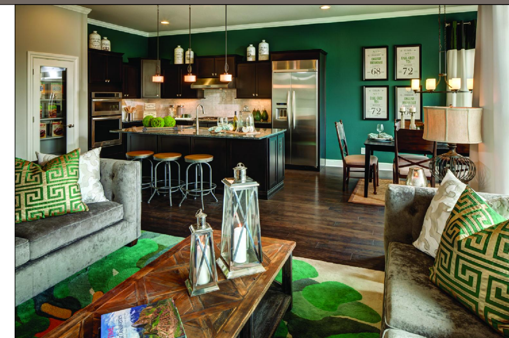
GREAT ROOM & KITCHEN WITH OPTIONAL DOUBLE WALL OVEN